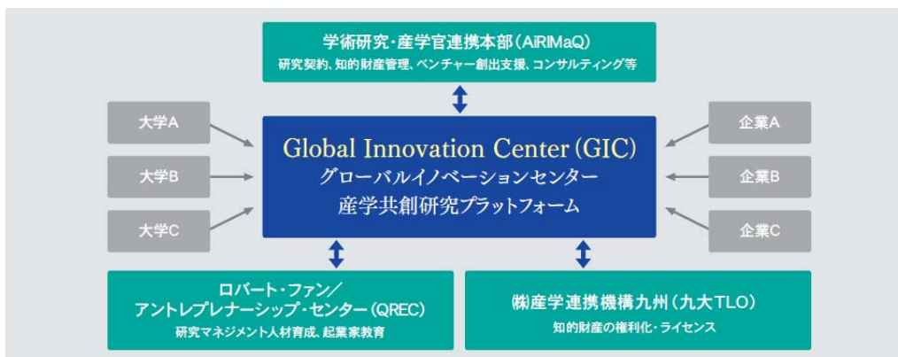
Ecosystem of KOINE

【Contact】 Global Innovation Center Tel : 092-583-7378 Mail : sympo0407@gic.kyushu-u.ac.jp