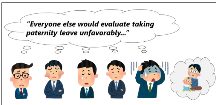
Fig. 1. Paternity leave in Japan and pluralistic ignorance