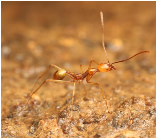
Fig. 1. New cave ant species Aphaenogaster gamagumayaa

For more information about this research, see “ Aphaenogaster gamagumayaa sp. nov.: the first troglolithic ant from Japan (Hymenoptera: Formicidae: Myrmicinae),” Takeru Naka & Munetoshi Maruyama, Zootaxa (2018), DOI: 10.11646/zootaxa.4450.1.10