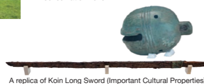
A replica of Koin Long Sword (Important Cultural Properties)

Many valuable buried cultural properties have been discovered at Ito Campus.