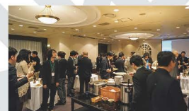
Photos from Exhibition, Ceremony, and Symposium