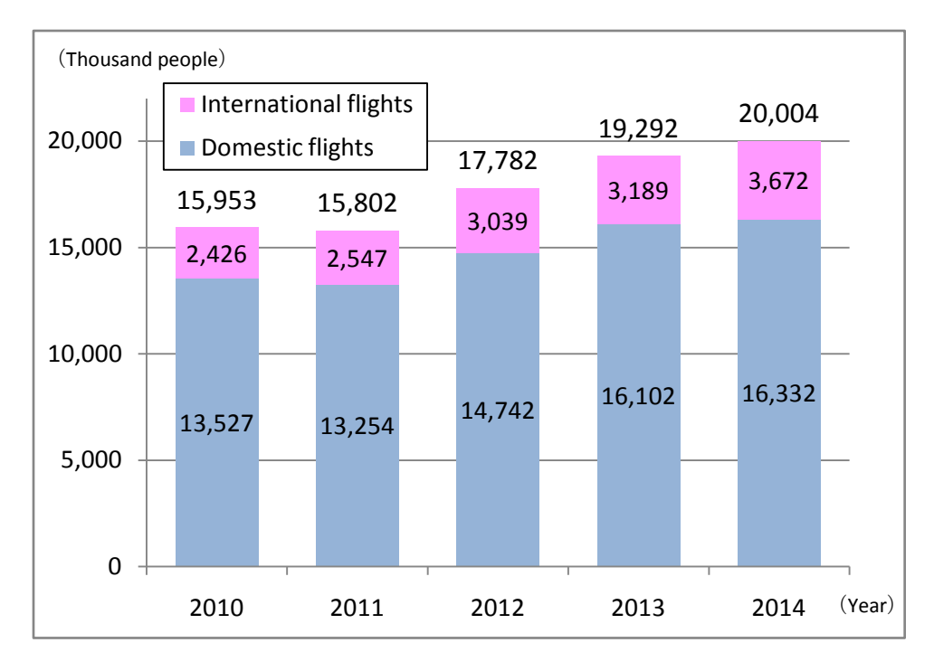
Figure 1: Shifts in passenger numbers at Fukuoka Airport