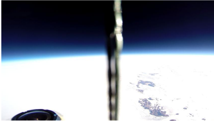
Fig.4 A picture taken from Phoenix-S1 at 23km in altitude.

Bare rock area of Soya coast is seen at the right.