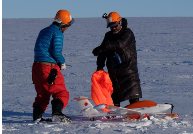
Fig.2 Phoenix-S1 returned to S17 from the altitude of 23km.

The Phoenix-S1 UAV has been newly developed improving the prototype UAV used in the JARE-54 so that it has more payload space and bears up severe environment such as low temperature down to -80 degrees C and lower air density at 30km in altitude. Fig.2 shows the Phoenix-S1 just after the retrieval at S17, and Table 1 describes the specifications of the UAV. Because it was predicted that the flying speed of Phoenix-S1 at 30km in altitude becomes close to the sonic speed if it flies under the same condition close to the ground, the structural strength and the flight control performance will go beyond the limit of the design at such a high altitude.