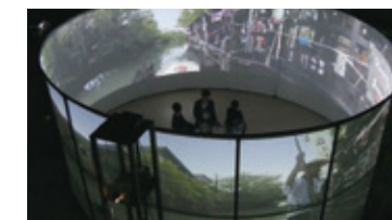
Proposal of new experiential type video contents using full-circumference screen