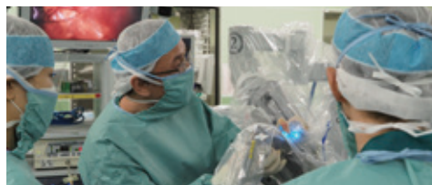
Da Vinci surgical system