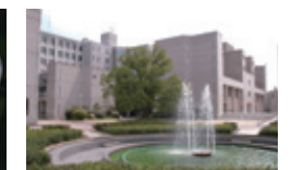
Home to Art and Design