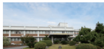
Home to Internal Medicine, Surgery and Orthopedics