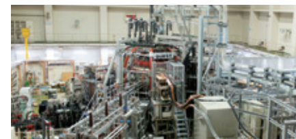
Q-shu University Experiment with Steady-State Spherical Tokamak (QUEST)