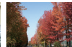
Home to Engineering Sciences