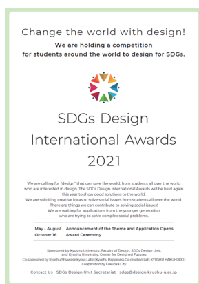
Fig. 1. Flyer

Theme 2: Designing a Carbon-Neutral Lifestyle