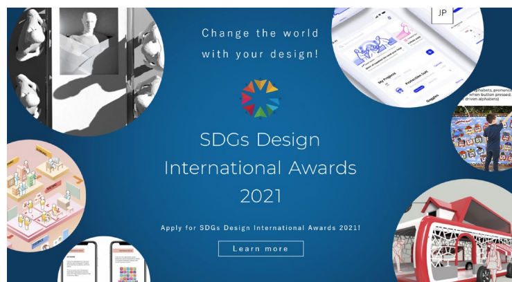
Fig. 2. Official website