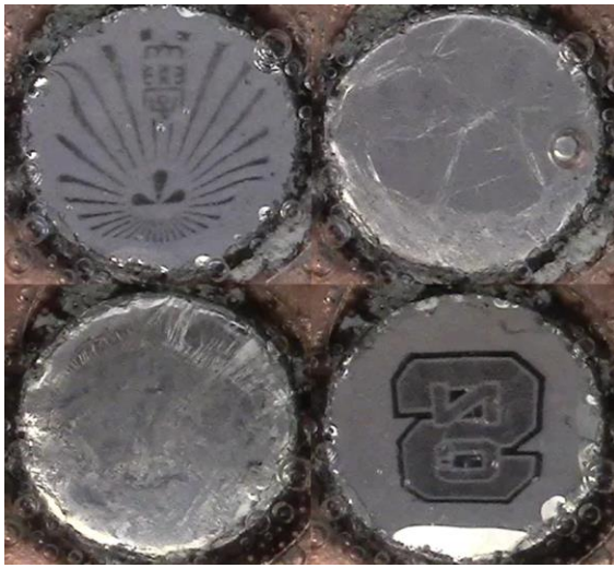
Figure 1. Researchers have developed a way to dynamically switch the surface of liquid metal between reflective (top left and bottom right) and scattering states (top right and bottom left). When electricity is applied, a reversible chemical reaction oxidizes the liquid metal, creating scratches that make the metal scattering.