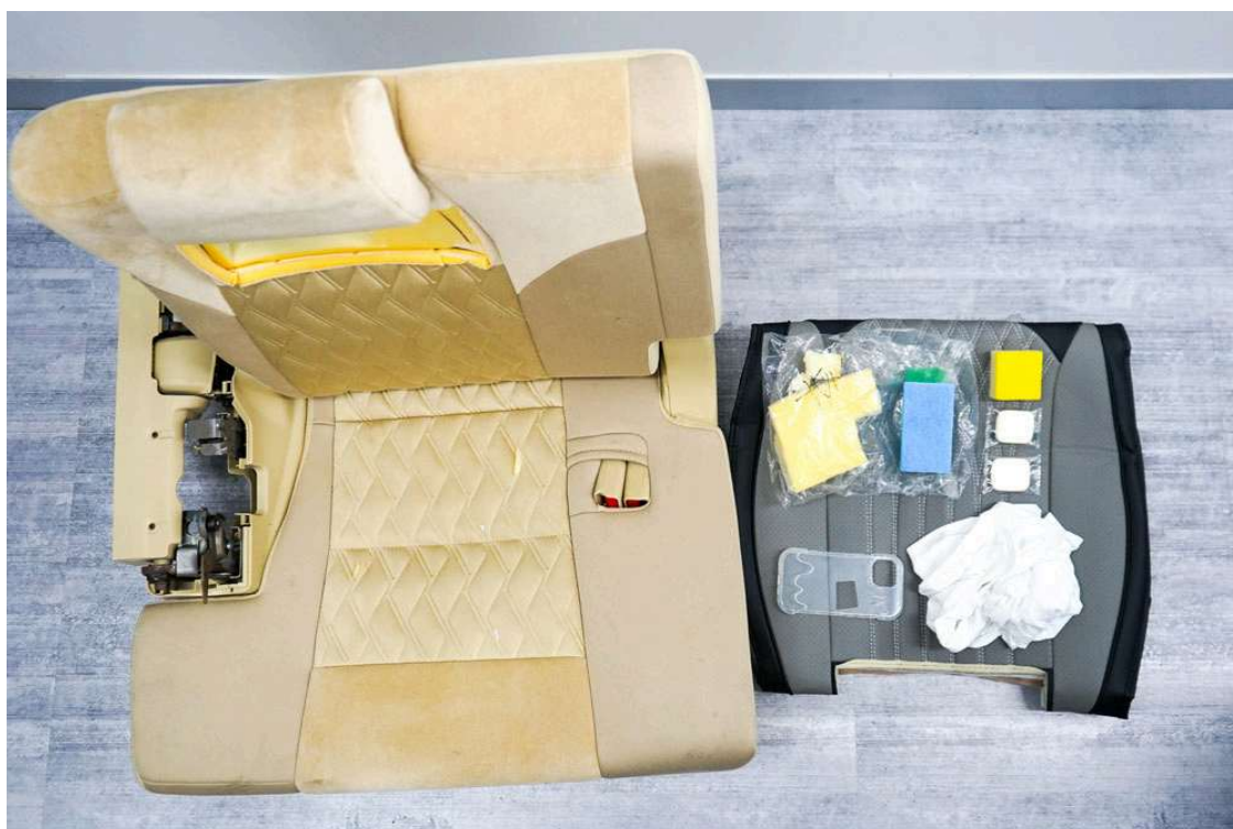
Fig.1. Rewriting the reactivity rules: A new catalyst for recycling mixed plastics

Beyond laboratory experiments, the team tested the method on real commercial products. A kitchen sponge and blended underwear, containing PU alongside polyester and nylon, were successfully treated, with the PU breaking down into reusable components while the polyester and nylon stayed intact. The method also worked on a mobile phone case and an end-of-life car seat.